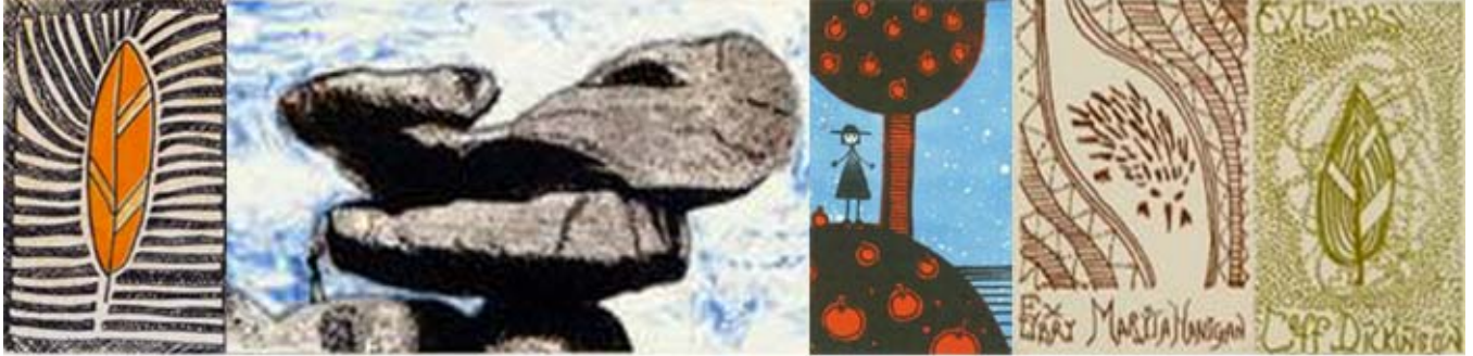
Students' work from the Ballarat workshop