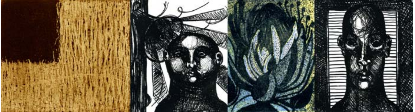
Prints from our first workshop at BDAS in 2010