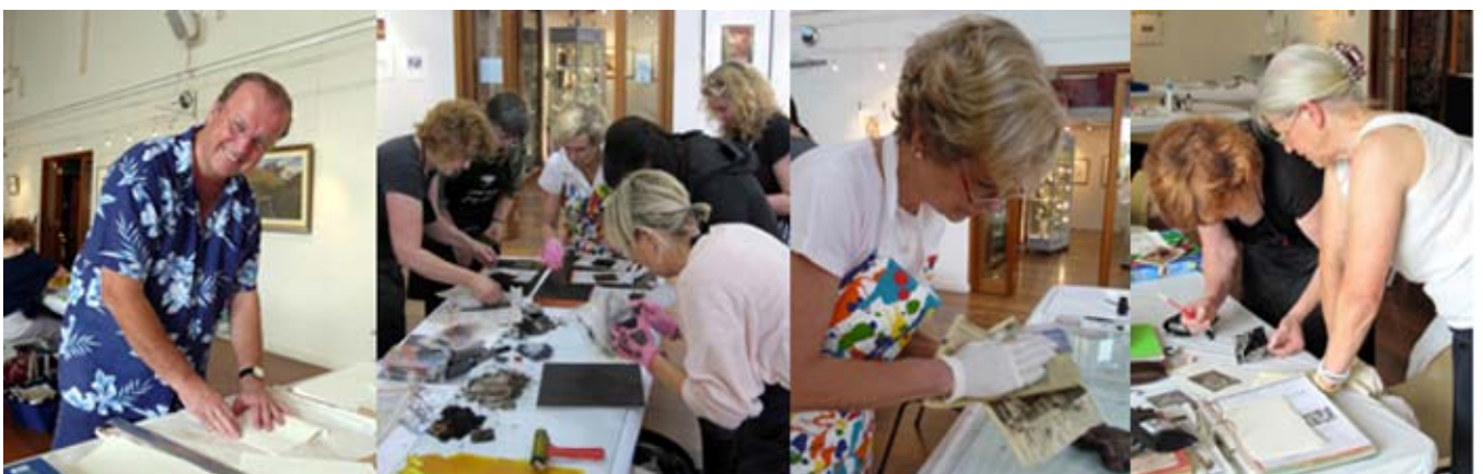
Students printing at the Milk Factory workshops