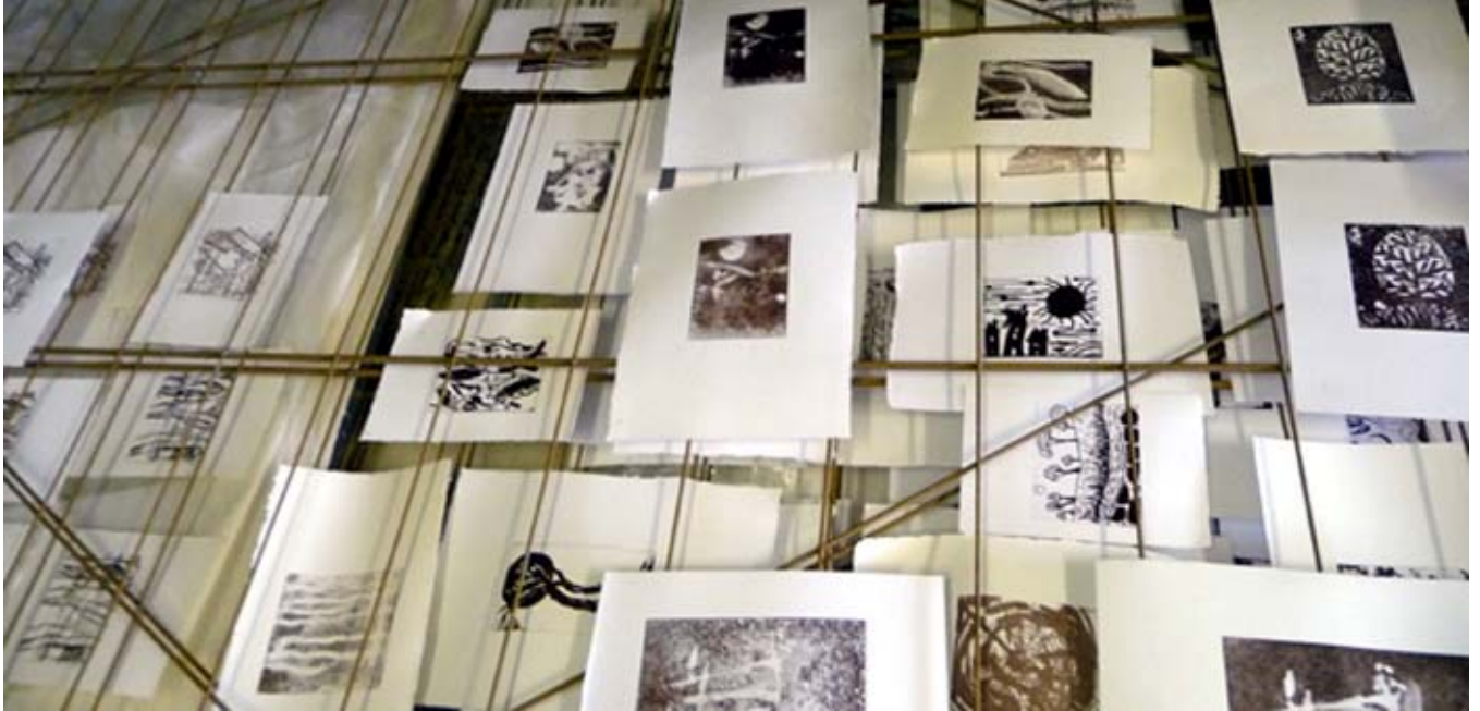
Students prints drying on the racks at Newcastle