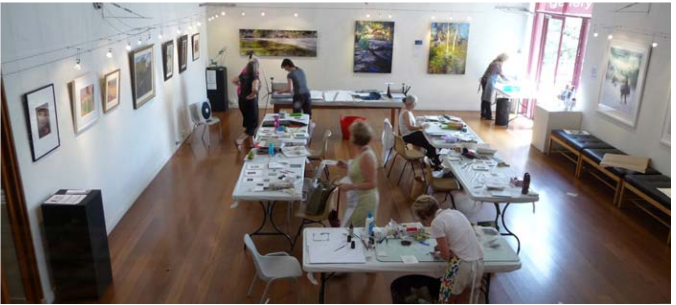
Class in progress at the Milk Factory