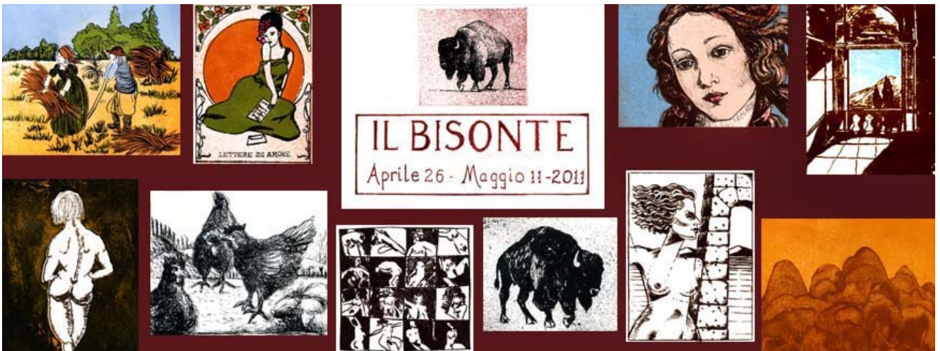
Participants works from 2011 Florence workshop above