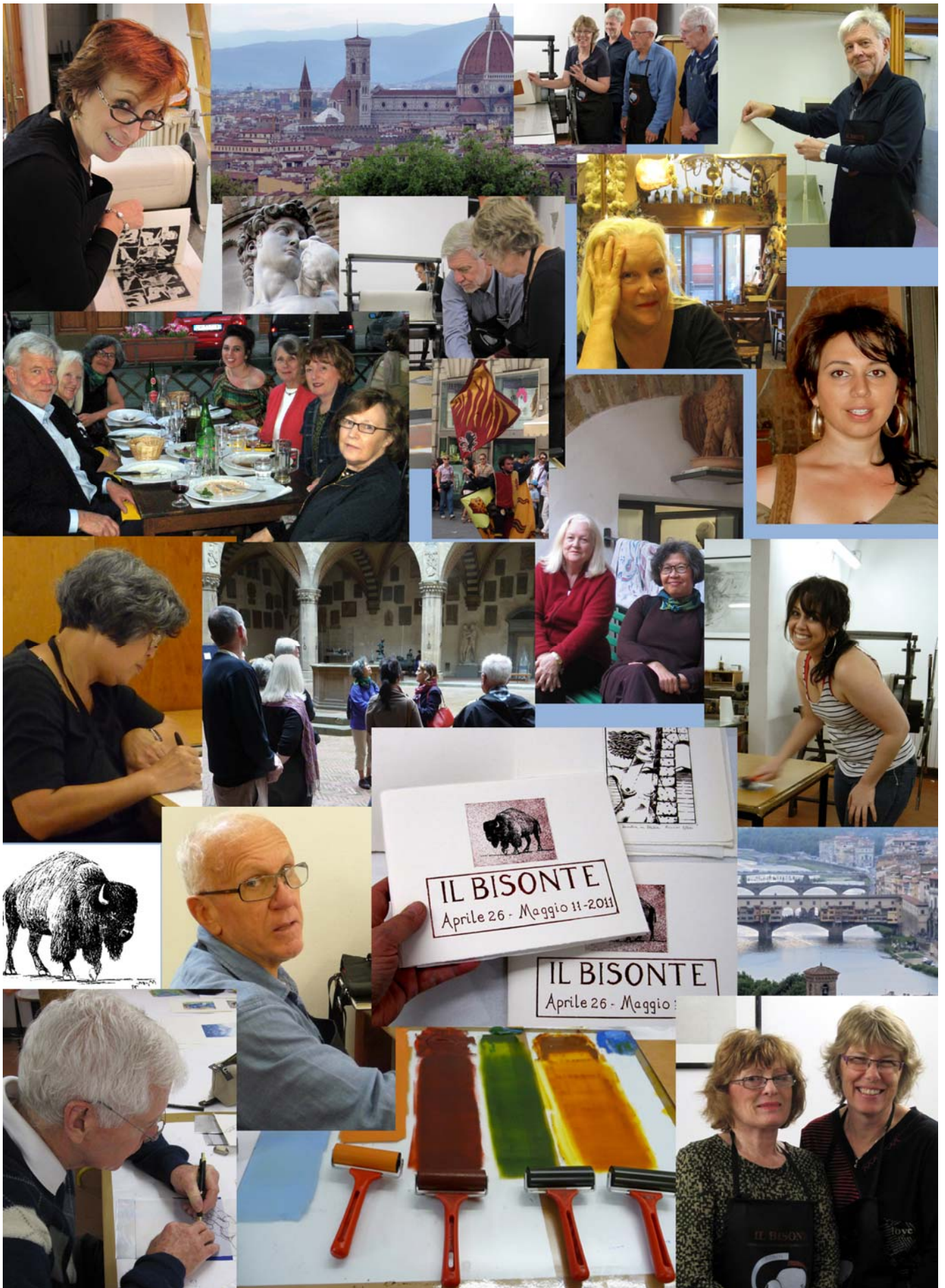
Class of 2011