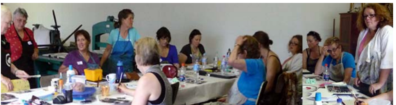
Workshop at Newcastle 2010