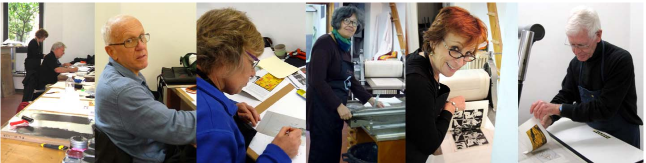
Some of the 2011 participants

That same evening the printmakers, in true Italian style, dined and socialised together, sharing anecdotes and enjoying getting to know each other before following in the footsteps of the masters to create some wonderful pieces.