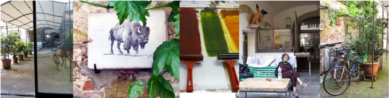
Around the studio courtyard