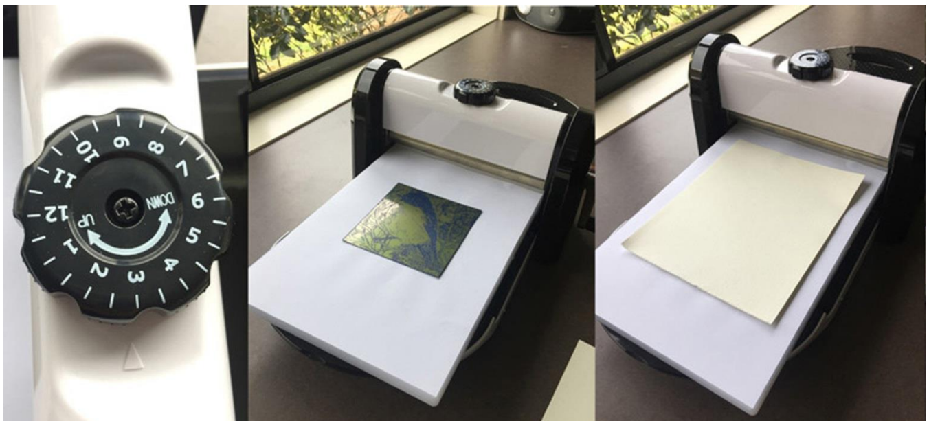
Set pressure to 3

Set the pressure to 3 and use a soaker blanket. Vary pressure for thicker blanket. Ink the plate, use dampened printmaking paper and print as shown below.